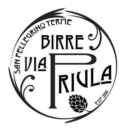
(Loertis) "Birra Quotidiana" -SlowFood "Guide to Italian Beers" 2013, 2015, and 2017