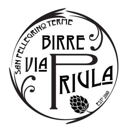
(Loertis) "Birra Quotidiana" -SlowFood "Guide to Italian Beers" 2013, 2015, and 2017